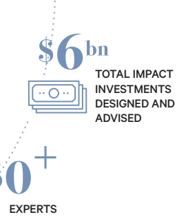
IMPACT FINANCE PROJECTS

Our team includes 30+ experts in impact & blended finance investment strategies, vehicle design, structuring and implementation, impact advisory, fund management and reporting services, and legal advisory with our in-house legal team.